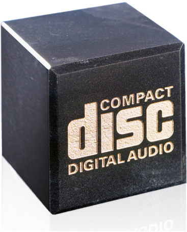
Marble Cube Award

Starting At $155.00* || As Low As $136.67* Min. Qty. 1